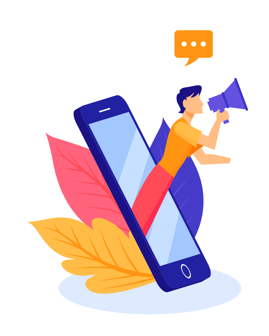
EXCELLENT COMMUNICATION SKILLS (VERBAL & WRITTEN)