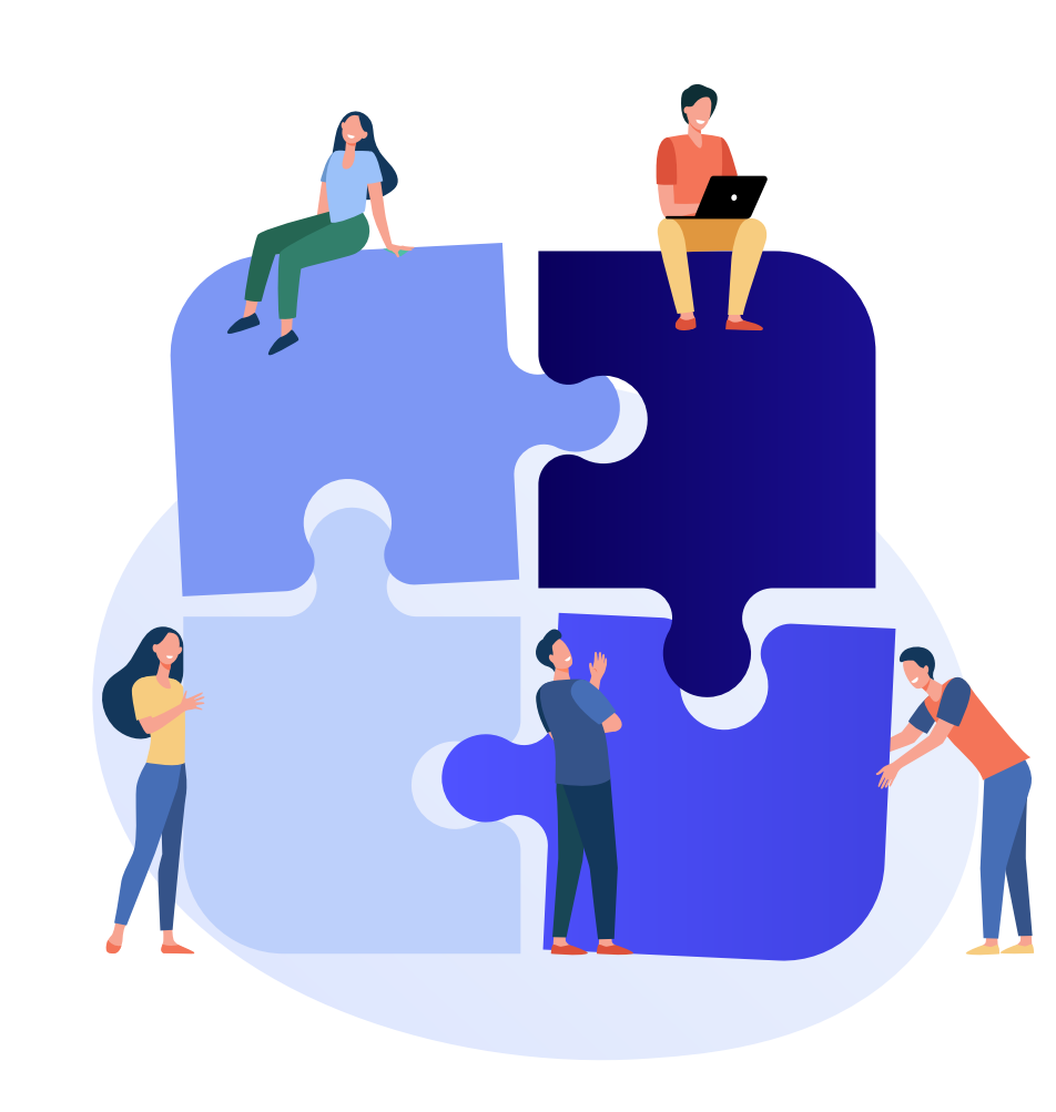
ABILITY TO WORK AS A TEAM & SUPPORT YOUR COLLEAGUES