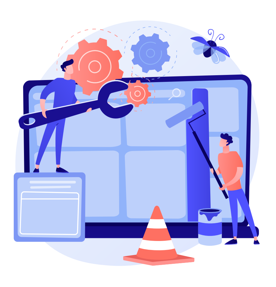
ABILITY TO ASSIMILATE COMPLEX INFORMATION